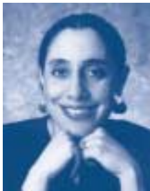
Reclaiming the Public in Public Higher Education Lani Guinier , Bennett Boskey Professor of Law, Harvard Law School